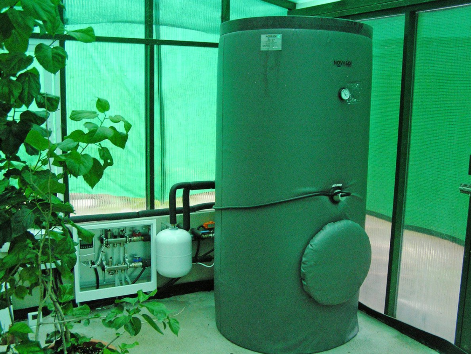
The water storage tank and pump which pipes warm water under the new floor of the greenhouse.

I hope there will be no more problems and that I can grow my tropical hibiscus successfully, although I will never be able to do it like the friends who live in warmer climates.