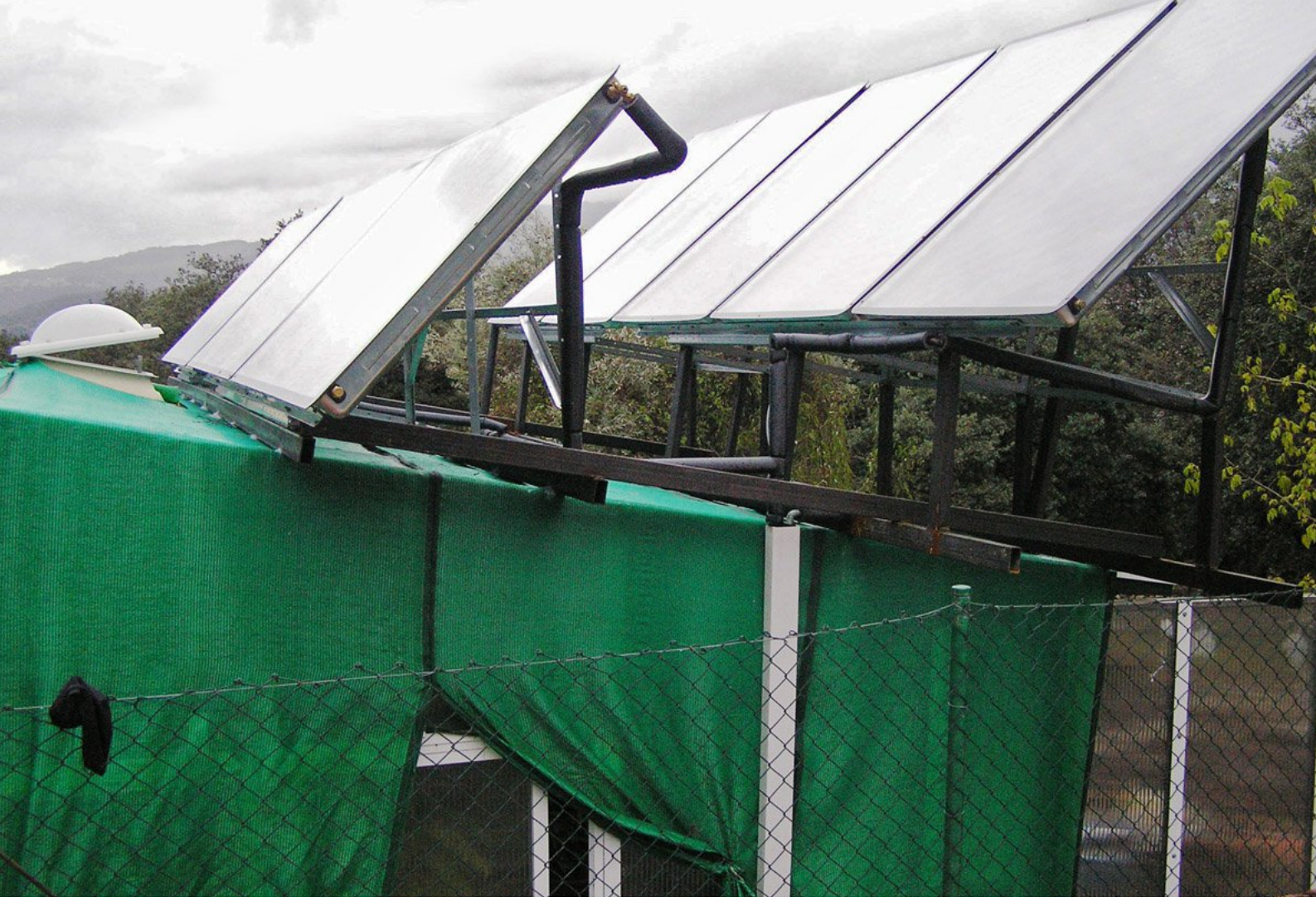
The double array of solar panels installed to heat the greenhouse.

However, using this solar power system does have some drawbacks, such as that it is very expensive to install. However, if you think about the fuel you could save, the expense looks less dramatic. Another drawback is that the system runs on electric power to collect solar energy which could be a problem during a power failure.