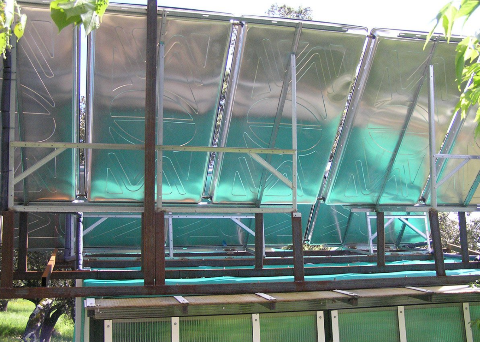
Above: A view of the underside of the solar panels.