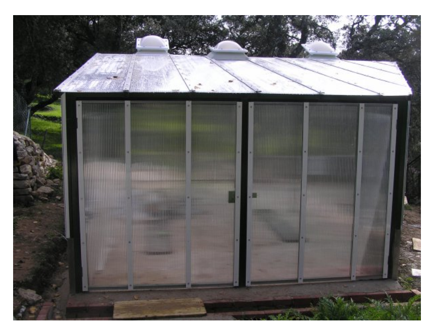
Left: The front of my greenhouse before the addition of the solar panels.