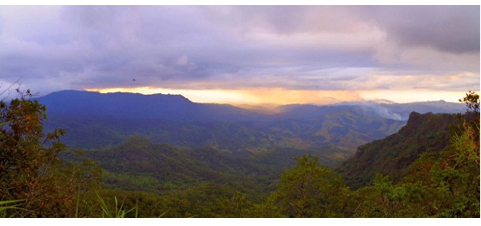
Hibiscus storckii's view: looking west from Mount Delaikoro

As it turned out, in November last year I was travelling in Fiji collecting sandalwood leaf samples for DNA studies with Sonu Dutt (Fiji Department of Forestry) and Dr David Bush (CSIRO).